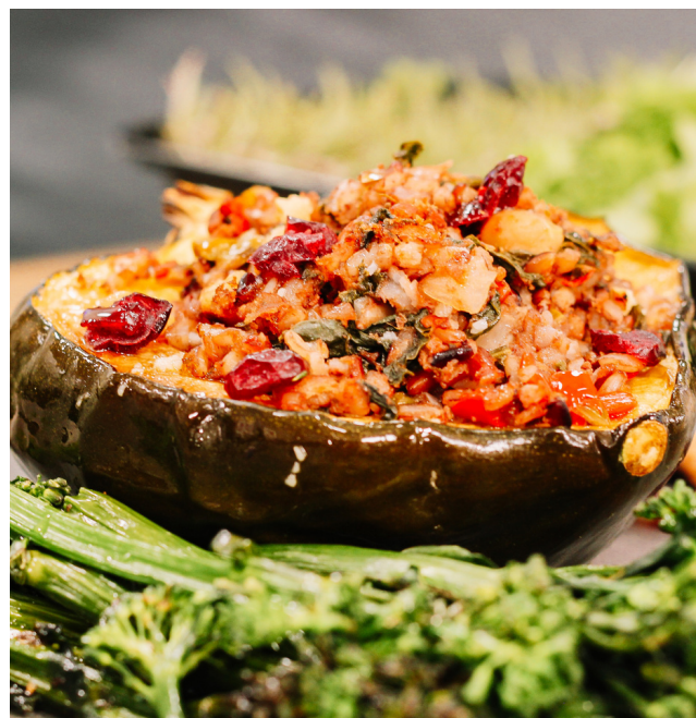
Stuffed Acorn Squash