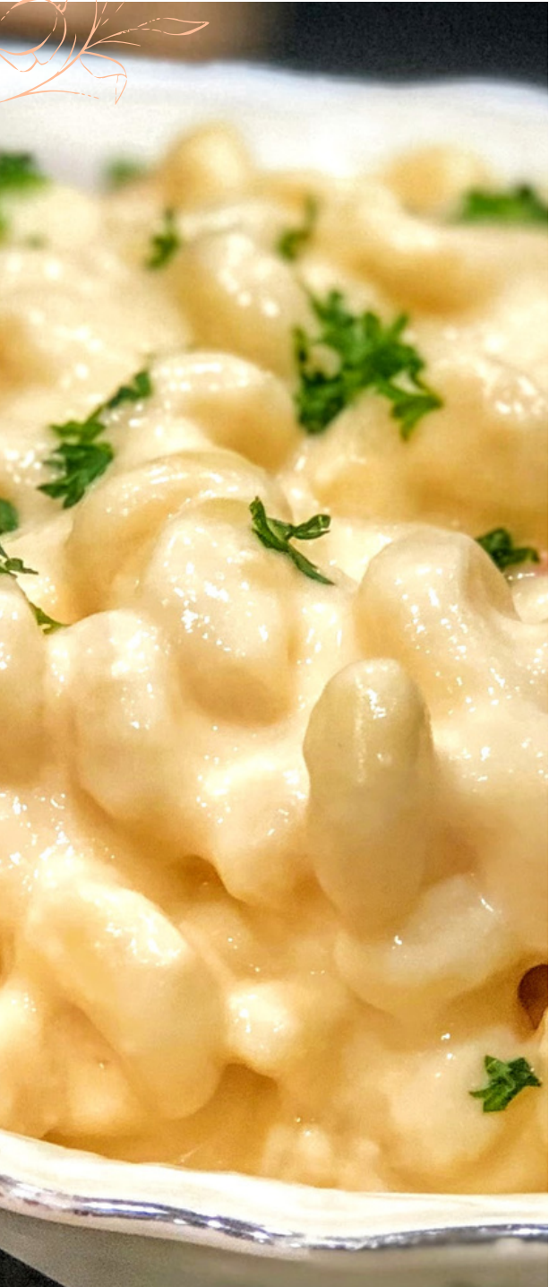
Mac & Cheese

Roasted Broccoli Fresh broccoli florets drizzled with extra-virgin olive oil and roasted