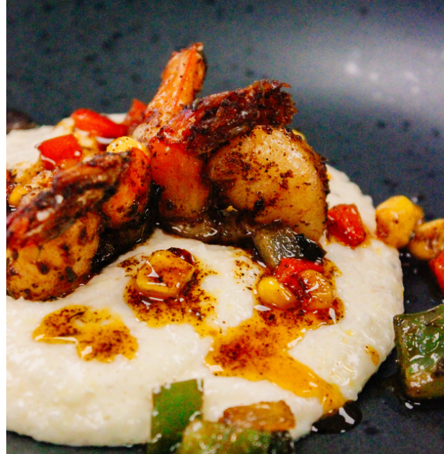
Cajun Shrimp & Cheesy Grits