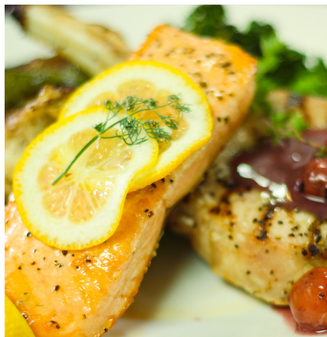
Lemon Garlic Baked Cod