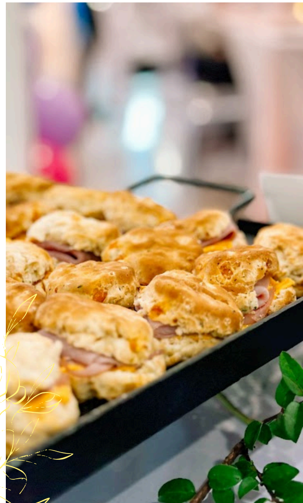
Ham & Cheese Sliders on Garlic Cheddar Biscuits