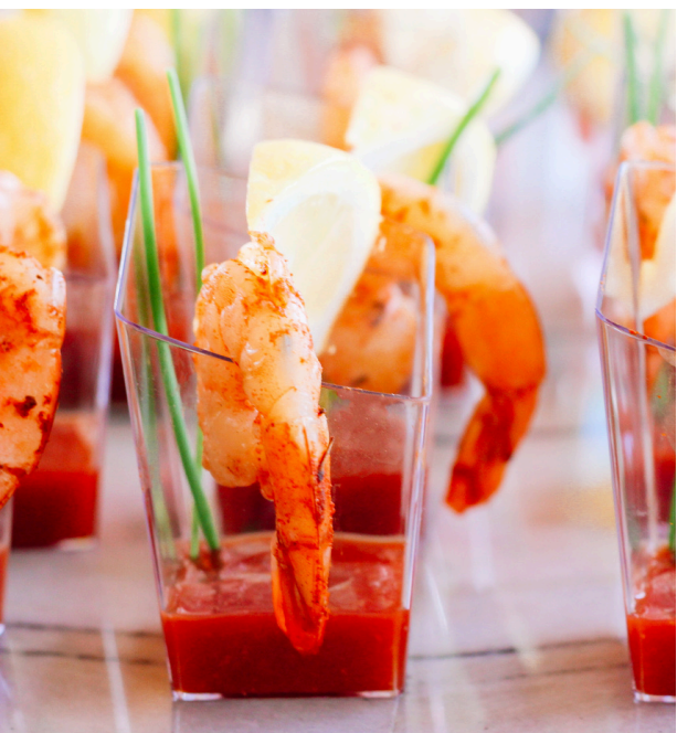
Cajun Shrimp Shooters