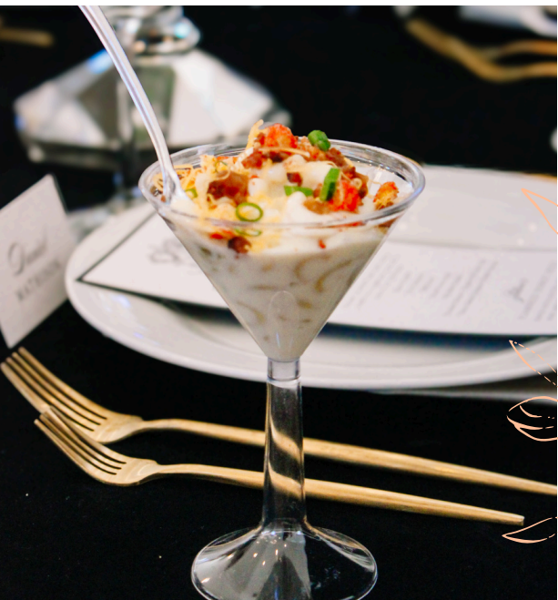
Mac & Cheese Tini