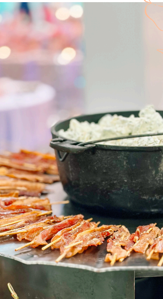
Bacon Praline Skewers & Spinach Artichoke Dip