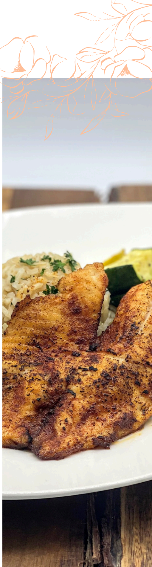
Pan-Seared Salmon with Cilantro Lime Butter

Mashed Yukon Gold Whipped with butter and cream