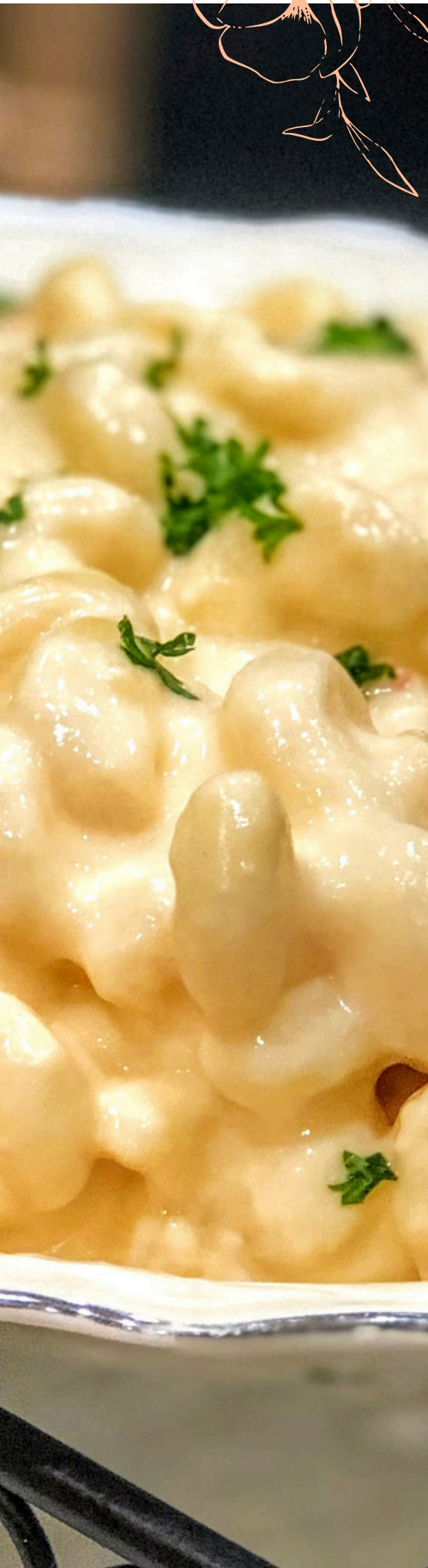
Mac & Cheese