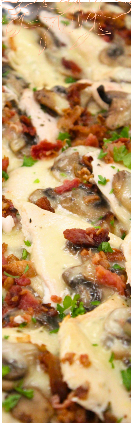
Smokey Mushroom Chicken

Cajun blackened chicken with penne pasta tossed in a rich cream sauce made with a touch of Cajun spice, served with your choice of 1 side and garlic bread