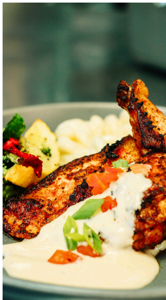
Blackened Chicken Breast with Cajun Cream Sauce