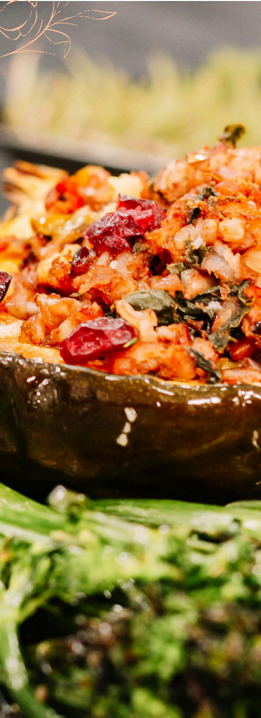
Stuffed Acorn Squash

Twice-Baked Potato Casserole – Creamy potatoes blended with cheddar cheese, topped with green onions and applewood-smoked bacon.