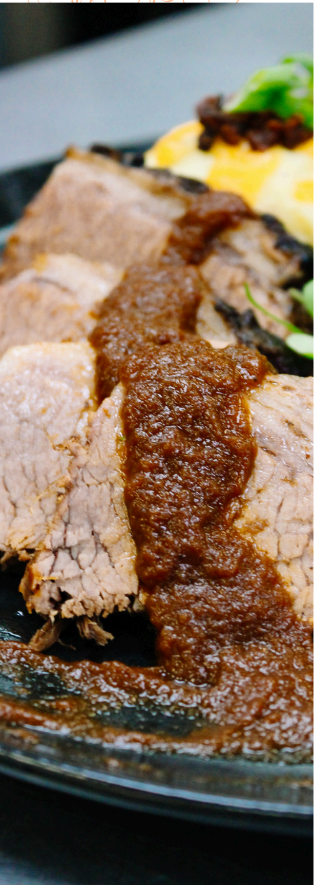
Cabernet Braised Brisket

Wrapped in smoky applewood bacon and roasted to perfection, this dish is elevated with a delicate white wine reduction. Served with two sides, a garden salad, and dinner rolls.