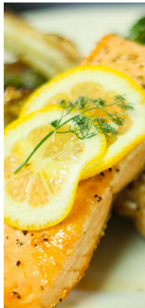
Lemon Garlic Baked Cod