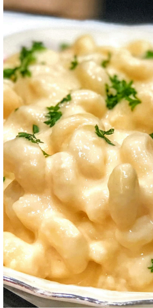
Mac & Cheese

Didn't see exactly what you envisioned for your wedding menu? Let our event specialists and chefs craft a custom menu tailored just for you!