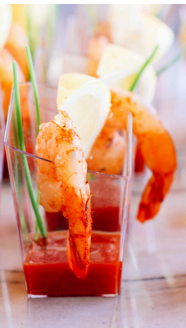
Cajun Shrimp Shooters