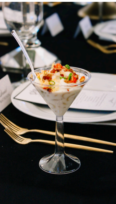
Mac & Cheese Tini